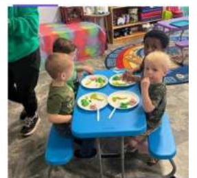
Green eggs and ham were a big hit at snack time today!