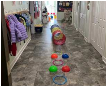
"It all began with that shoe on the wall"... Wacky Wednesday was wacky indeed!