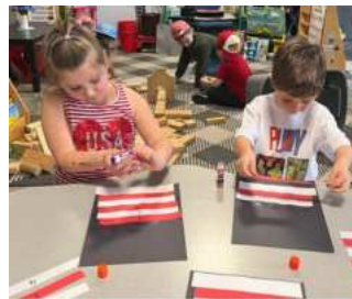
Dr Seuss Week is always so much fun!