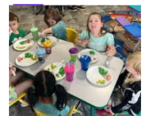
Green eggs and ham were a big hit at snack time today!